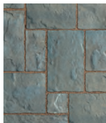
New York Blend